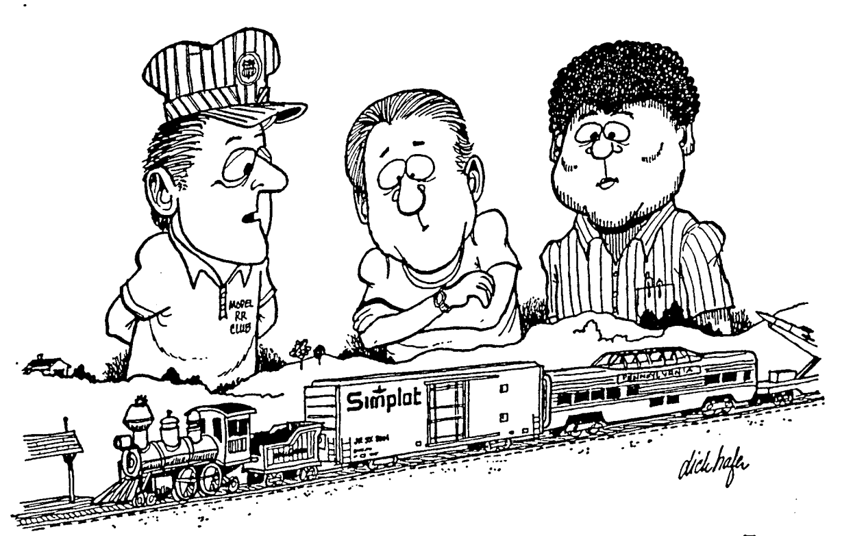
WELL... WITH A CLUB, YOU GOTTA BE SENSITIVE TO ALL OF THE MEMBERS' INTERESTS.

There are many safety rules and guidelines that can be discussed. The following article contains some very key ones. Railfanning is a very enjoyable pastime for those of us who like trains and railroading. To be injured in the course of the hobby would certainly seem to defeat the intent. To not practice safety and exercise common sense in the eyes of railway officials and employees does great damage to our reputation and can make it much more difficult to gain permission to enter facilities, or even be on the right-of-way. It can, and even has, led some railroads to enforce their rights as private property owners against all trespassers, including railfans. Do enjoy being a railfan and railroading, but act safely, exercise common sense, and respect the rights of the railroad company and its employees. The article on the following page by Ed Painter contains some good advice for all of us.