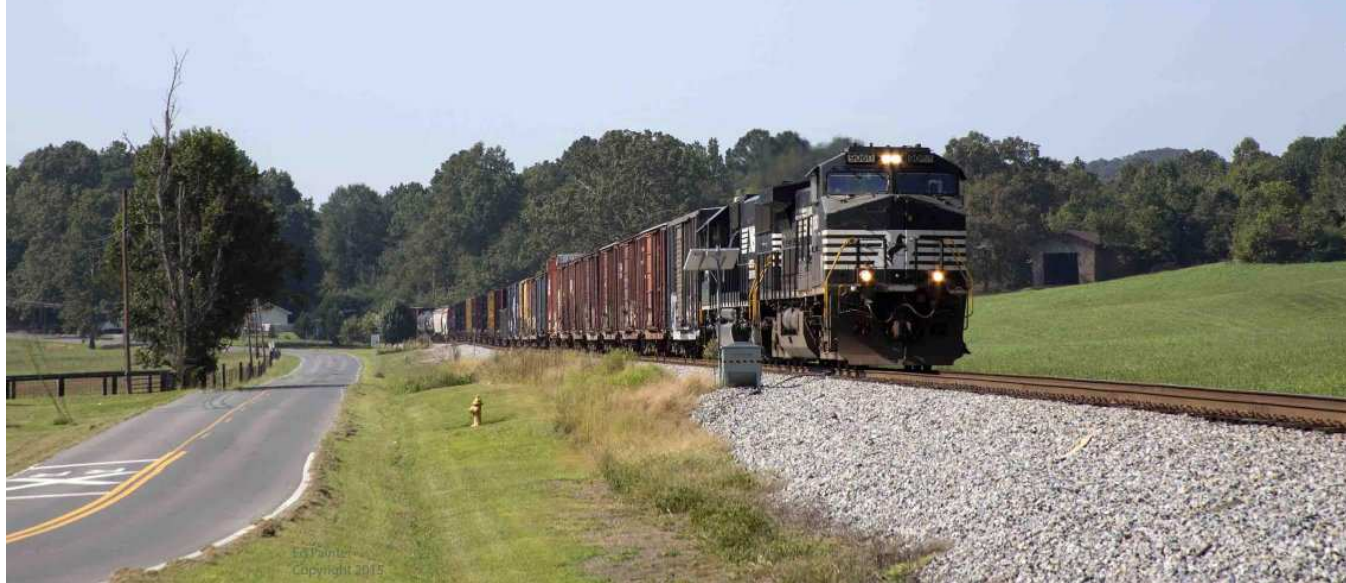
Cohutta, GA is in the northwest corner of Georgia. The town emerged as a stop on the railroad from Cleveland, Tennessee to Dalton, Georgia, and served as the center for the surrounding farming areas. According to local lore, the town was originally known as Shakerag from the rag would-be passengers would wave to stop trains passing through.