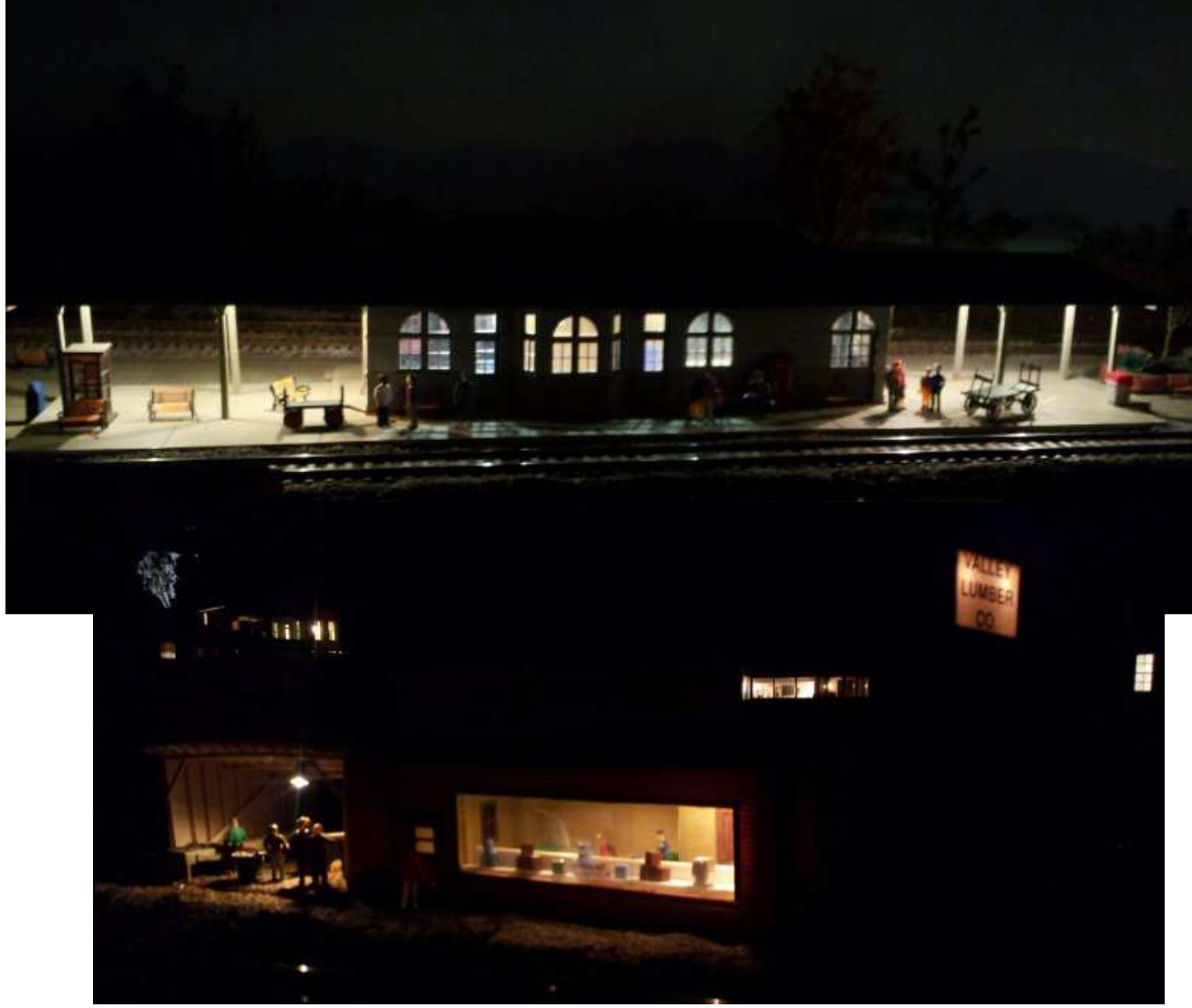
Central Crossings - Newsletter of the CRM&HA

I took the opportunity after October's Operations Night to take a few photos around the layout to see how things might look for night-time operations on the Central Railway. These night-time shots were taken around Seneca. I'm no be O. Wintson Link, but I think the night shoots offer a neat perspective on the Museum's layout.