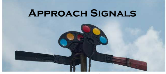
Upcoming Events for the