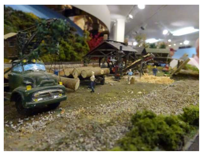
Above: A logging camp on Bob Folsom's N&W layout.

Below: A maintenance shed along the N&W right-of-way