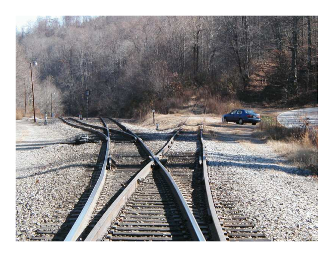
Here is a dwarf signal definitely showing a stop aspect. It is at the west end of that double track.

Also shown is the double track which goes on down to MP 36.2 the Slaughter Pen Cut. I suspect that this is the area where helper locomotives were added for the uphill run.