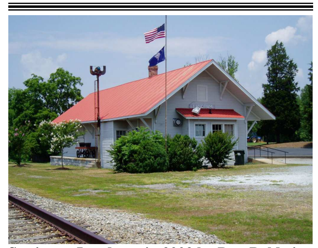
Station at Landrum in 2002

Certainly I will apply a few of the concepts and various excerpted track segment designs to my own home layout which will soon begin its 4th (5th?) year of not being constructed yet –A.K.A.: Google "analysis paralysis".