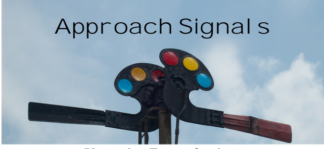
Upcoming Events for the