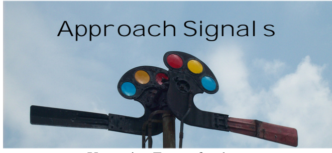
Upcoming Events for the