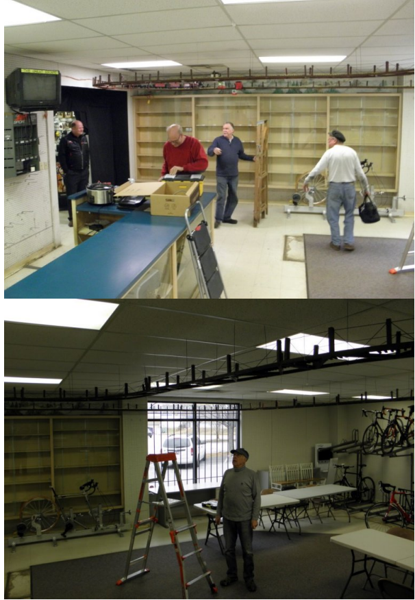
Crew at the Great Escape in Spartanburg, SC.

Admission: Free http://centralrrfestival.org