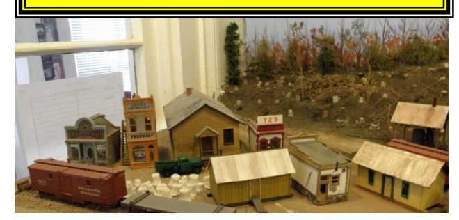
Some of the buildings donated from the Great Escape have found their way to the logging camp