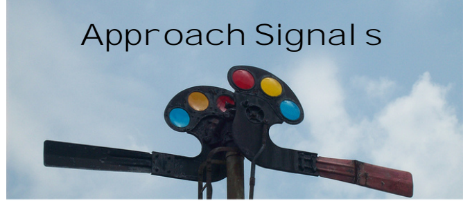
Upcoming Events for the