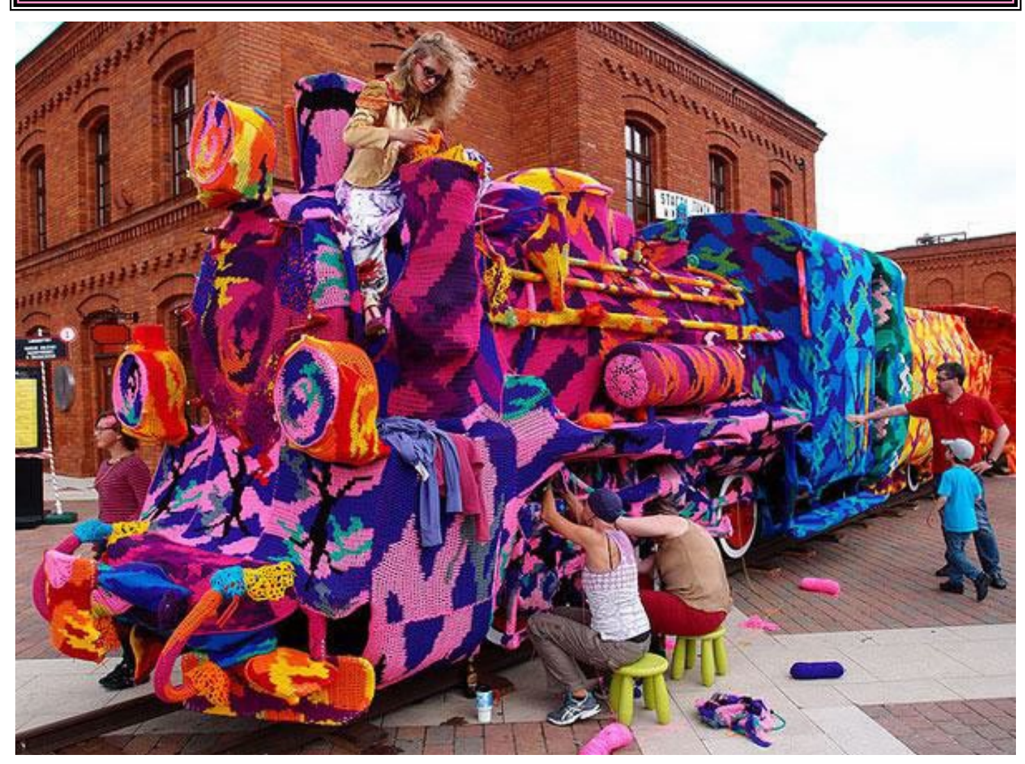
An American artist has recently yarn bombed a steam train locomotive in Poland. The colorful fabric covers the whole engine and carriages and has brightened up the city.