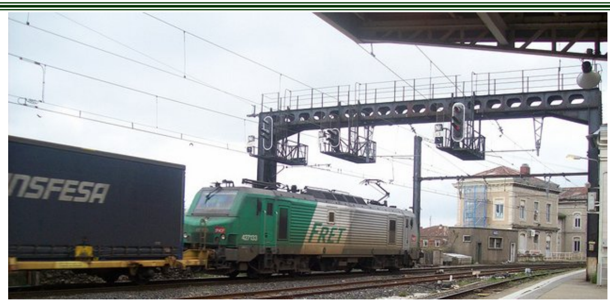
Someone at the SNCF (French National Railway) has a good sense of humor. SCNF's goods service has been given a name, "Frét" that when pronounced correctly, sounds like "freight".

Central Crossings - Newsletter of the CRM&HA