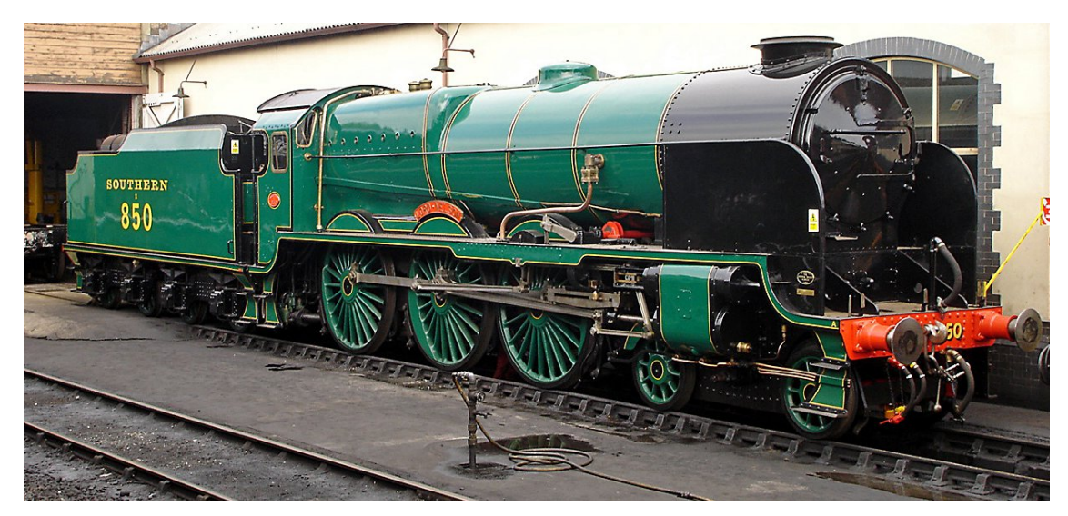
Southern Railway (UK) 'Lord Nelson' class 4-6-0 #815 Lord Nelson , at Minehead station.

The Southern Railway of England was formed in 1923 by the grouping of several smaller railways in southwestern England, along the southern coast, to London. The largest lines incorporated into the Southern Railway were London & South Western Railway (LSWR), the London, Brighton and South Coast Railway (LBSC) and the South Eastern and Chatham Railway (SECR). The railway remained in operation until 1948, when the railways were nationalized, and the Southern Railway became the Southern Region of British Railways.