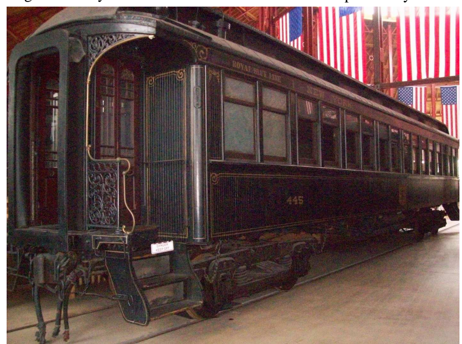
Vestibule passenger car at B&O Museum

train from Washington, D.C., to Los Angeles via New Orleans, which would have become the first truly transcontinent al train. The idea never came to fruition. leaving that distinction to Amtrak's Sunset Limited.