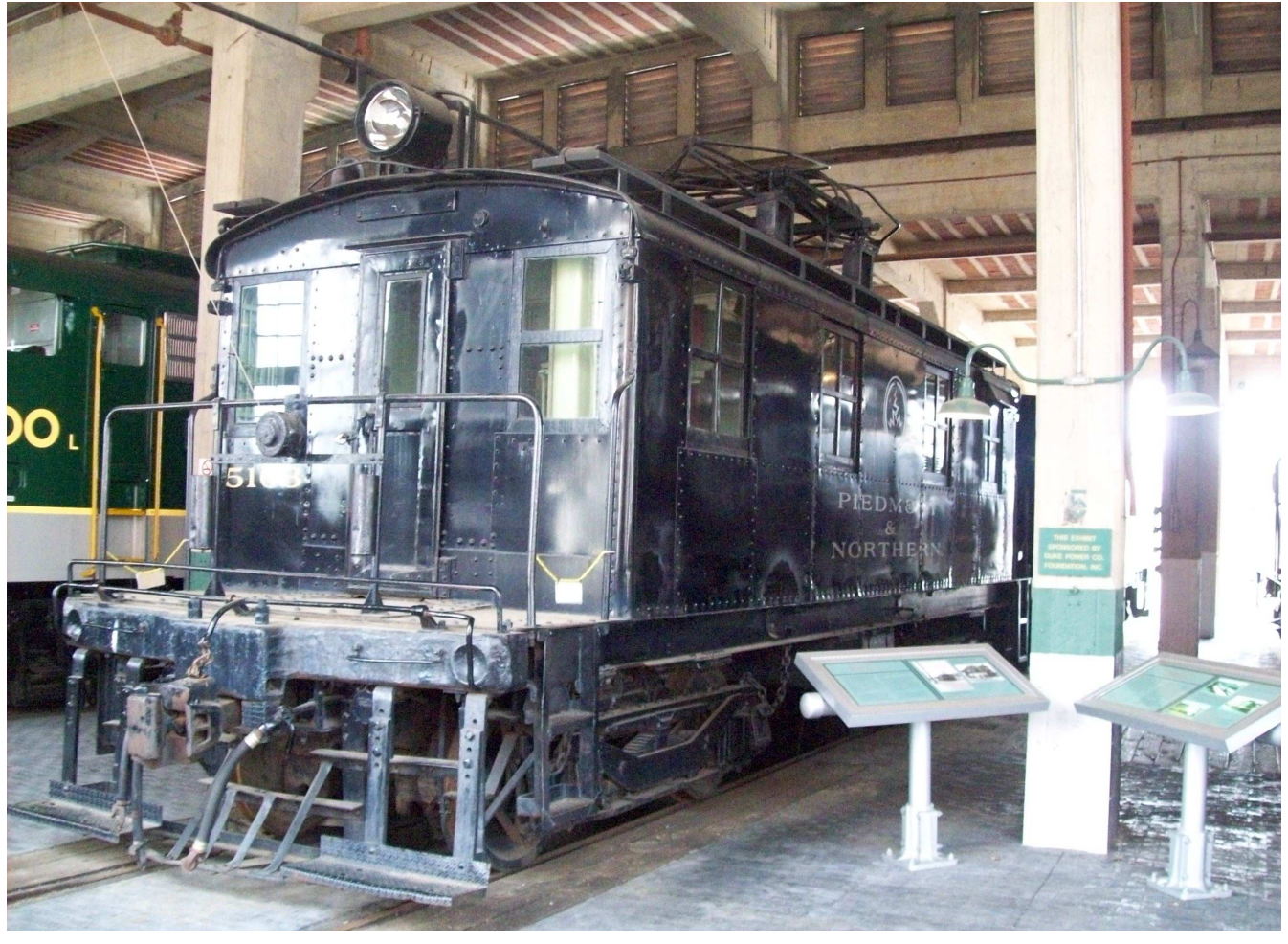
Piedmont & Northern's GE class 404-E-120-4-GE-212F 63-ton boxcab electric locomotive #5103 on display at the North Carolina Transportation Museum at Spencer Shops, NC.

The program was a DVD documentary of some famous train wrecks.