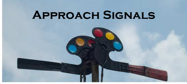
Upcoming Events for the