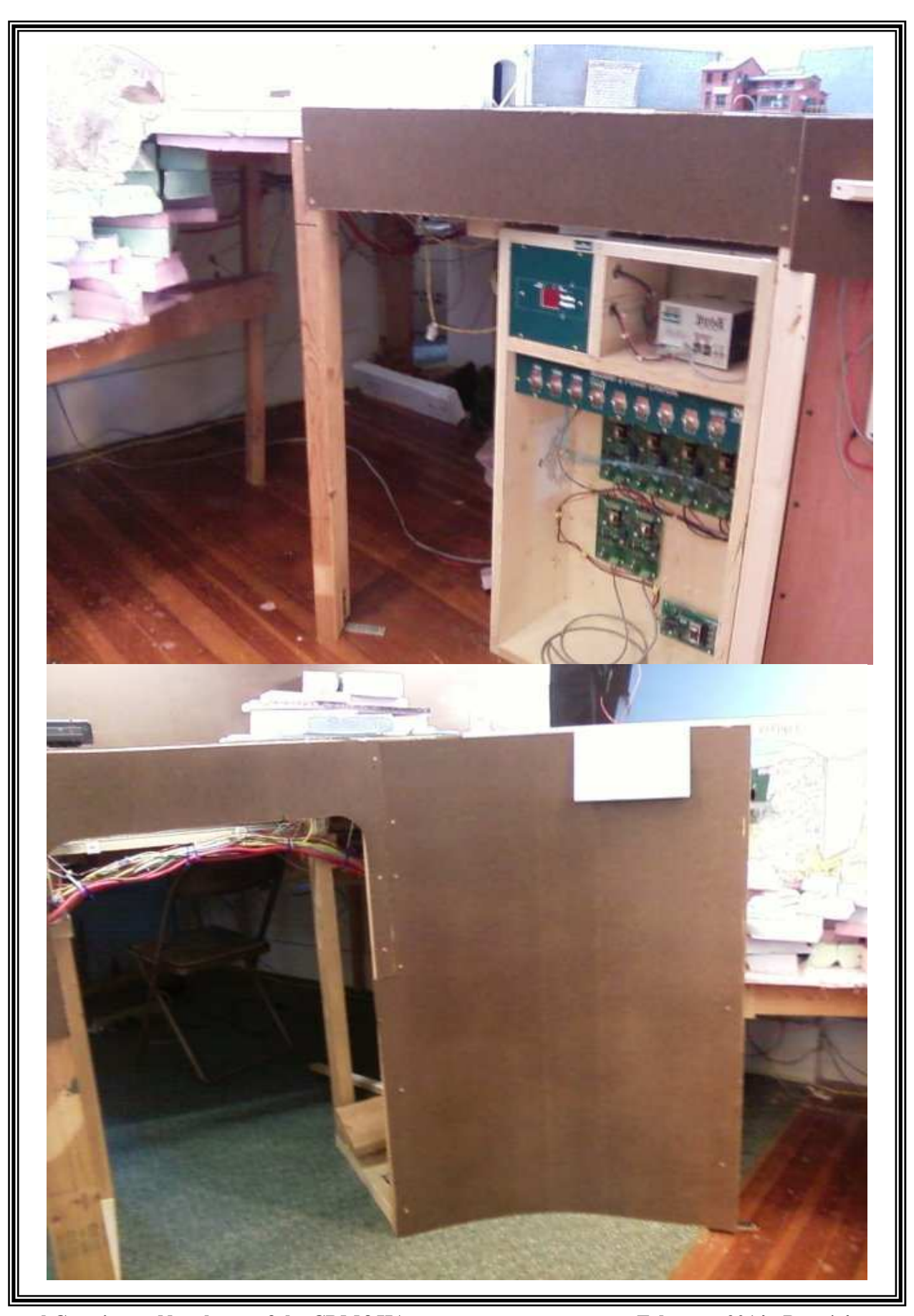
Central Crossings – Newsletter of the CRM&HA