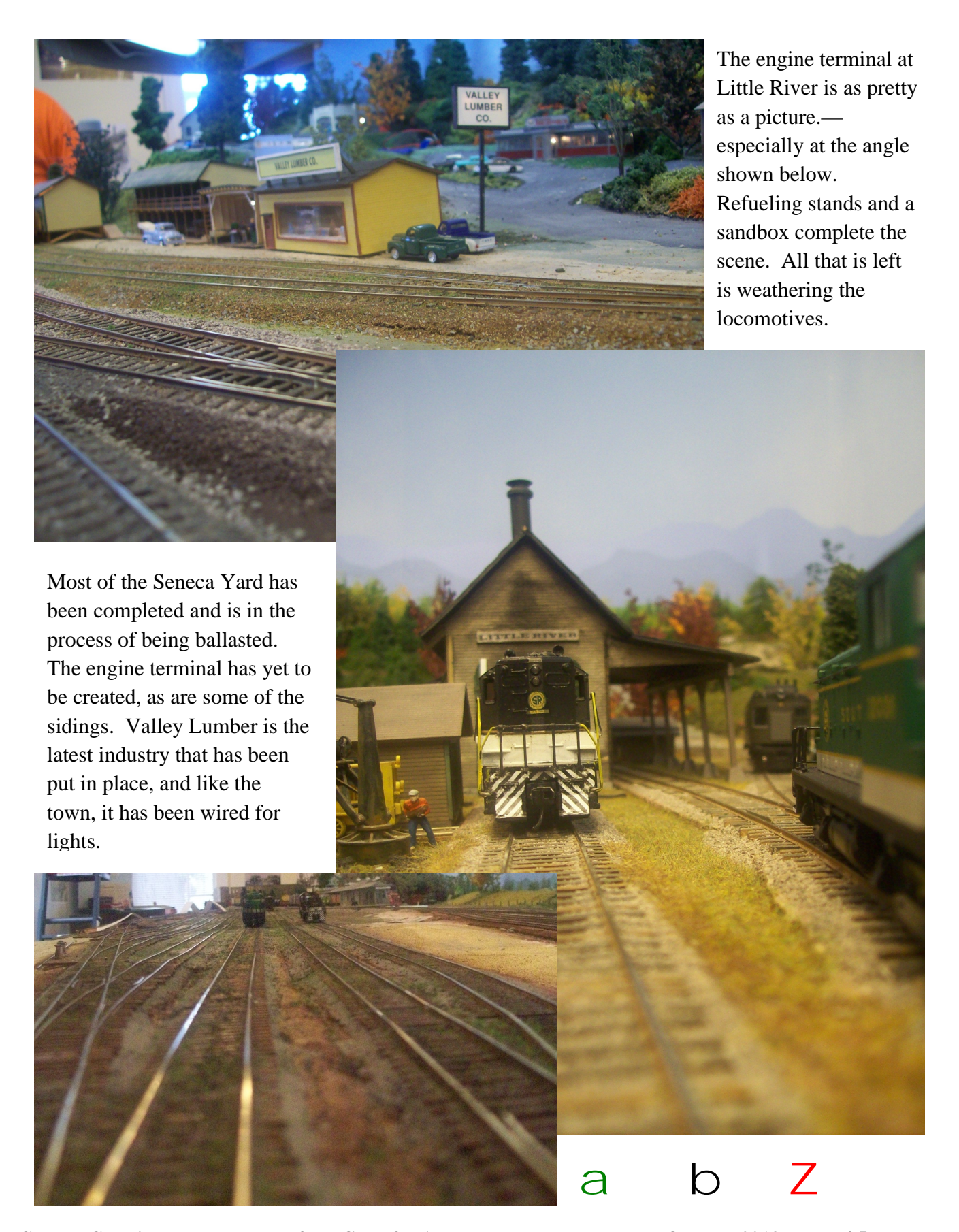
Central Crossings – Newsletter of the CRM&HA