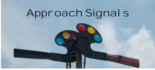
Upcoming Events for the