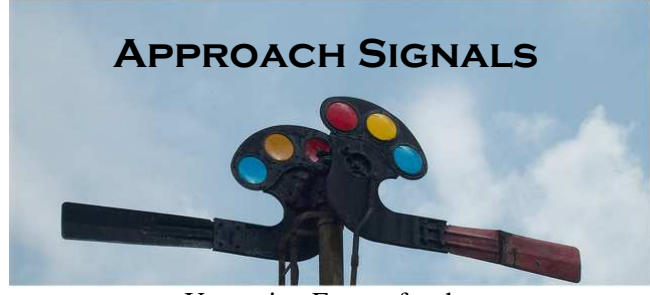
Upcoming Events for the