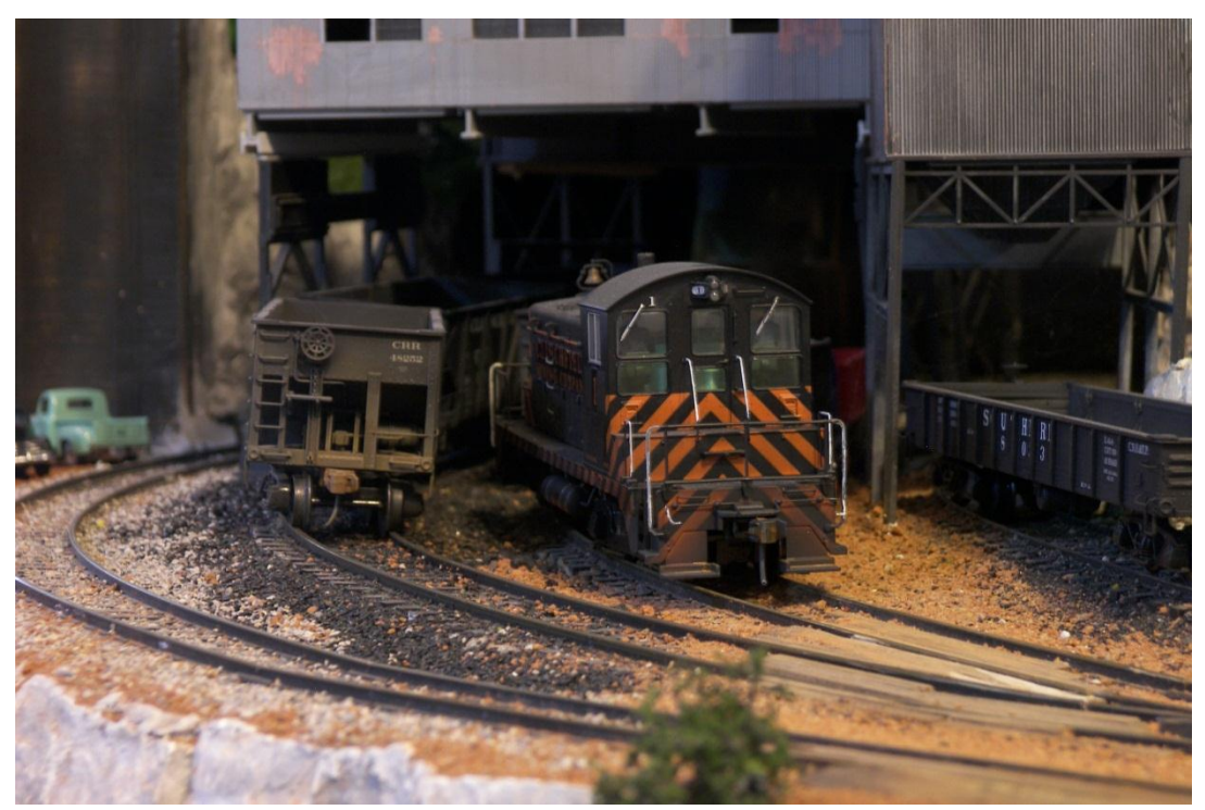
Old and new, tinplate and prototype, Clinchfield and Southern, Dale loves it all in S scale.

No visit to Pendleton is complete without a trip into Dale's back vard to inspect his 7/8N2 live steam loop. Dale first became interested in outdoor model railroading in the mid-1990s. Between 1996 and 2000, he installed two loops of G gauge track in a 20' long raised garden bed he built next to the garage for that purpose. He filled the garden bed with a variety of dwarf trees and shrubs and built several pieces of three-foot narrow gauge equipment – all based on the narrow gauge ET&WNC (aka "Tweetsie") Railroad in Boone, NC. But then, in 2001, Dale saw pictures of a live steam model of a Maine, two-foot gauge locomotive built to run on G gauge track – 45 millimeters between the rails. That scale works to out to 7/8" to 1' (hence 7/8N2), and Dale was immediately smitten.