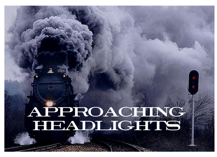
Upcoming Events for the Central Railway Model & Historical Association as well as Regional shows and events worth mentioning