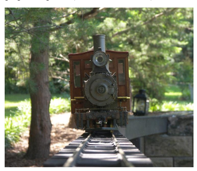
August 2012 Page 7

foot theme. Until very recently, everything from turnouts to wheel sets to locomotives to rolling stock had to be built entirely from scratch to model a two-foot theme in ANY scale. Dale immediately saw the benefits in using G gauge track components, locomotive mechanisms, and wheel sets to pursue a two-foot theme in 7/8" scale, and his big backyard gave him the space to do so. But Dale soon realized that his ET&WNC Railroad garden loop, though it had been laid with G gauge track, had curves way too sharp and clearances way too tight to accommodate cars and locos built in 7/8" scale, even diminutive two-foot gauge rolling stock (lower left, abandoned).