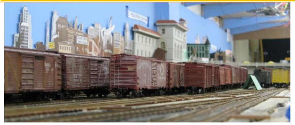
Progress on both HO and S layouts is apparent, especially when seen from scalelevel. It also shows how useful a modeling tool a camera can be, since an eye-level photo will show you things easily missed by casual or familiar distance observation. Besides that, it just looks neat!