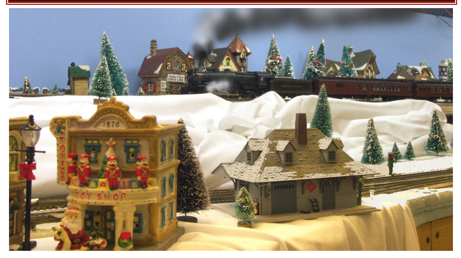
April 1, 2012, Central, SC

Anyone who attended this past year's Coats for Kids event, or any other holiday display will agree that magic sparks whenever Christmas and trains come together. After all, how many of us received our first train sets as Christmas gifts? And, how many of us wished that it could be Christmas every day?