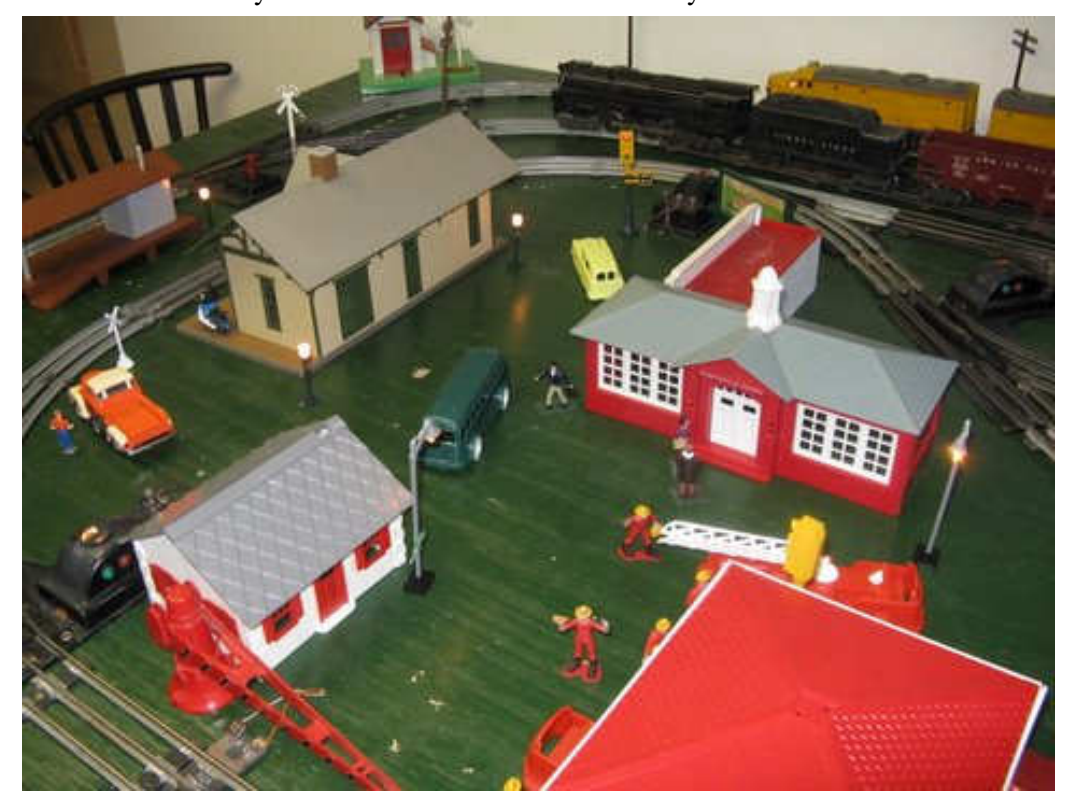
CENTRAL CROSSINGS, the CRMHA Newsletter

Above: Bob has just parked his scooter at the depot, waiting for some railfan action in this layout overview. Below: The Plasticville school, supermarket, firehouse, and train station clearly indicate where roads will be overlayed.