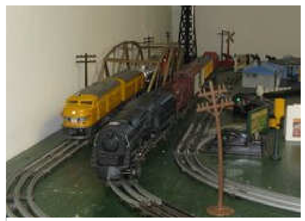
Above: Union Pacific 2023 crosses the steel bridge while Steam Locomotive 671 pauses on the siding. Below: The freight yard in the middle of the layout is a busy place when the milk car unloads.

When my dad went to the store in Drums, PA to purchase a sheet of plywood for the train (then a fairly new item in the market), he entered a drawing to win a car. It was a requirement that you had to buy plywood to enter the drawing. He won the car, a basic Studebaker that was so stripped he always claimed that it had no handles to roll up the windows!