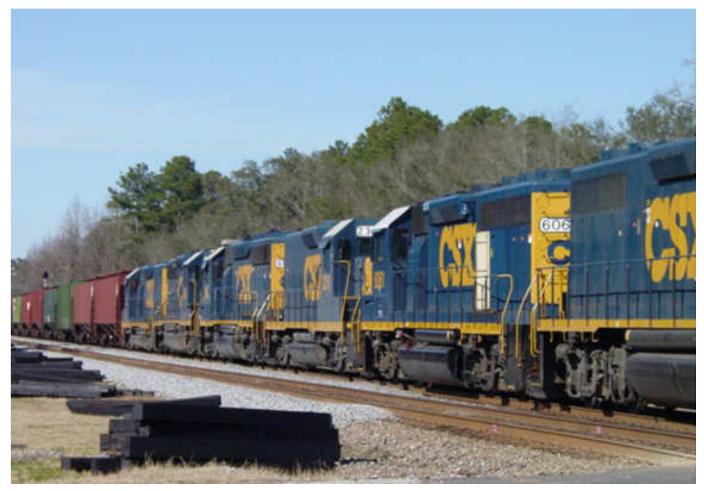
CENTRAL CROSSINGS, the CRMHA Newsletter

Below left: Folkston is the convergence of three US highways, six state highways, and all of the Atlantic Coast Line's tracks to Florida. Today, approximately sixty CSX trains pass through the Folkston Funnel each day, including some interesting ones like this power transfer movement.