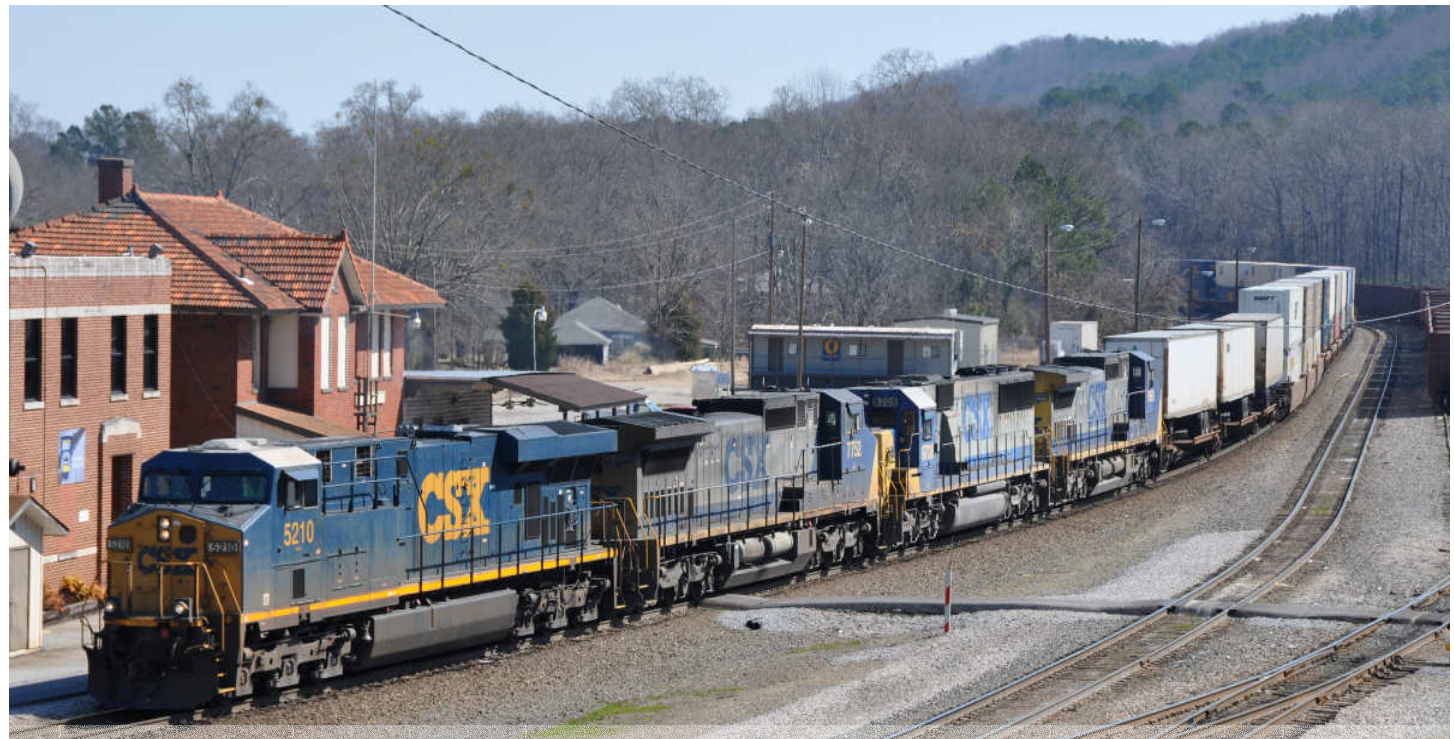
The Ramblers chased and leap-frogged this intermodal freight for a great distance on the way back north. Seen here in Manchester, Georgia are ES44DC No. 5210, C40-8W No. 7752, SD60 No. 8708, and C40-8W No. 7689.

In Manchester there is a Highway overpass across the railroad yard and we had a unique vantage point to watch "our" train depart northbound ( below ). If FDR died now they would have to run the funeral train on CSX because NS has abandoned its tracks in that area.