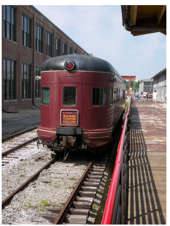
NRHS Roanoke Chapter observation car "Mardi Gras" currently resides in Spencer.