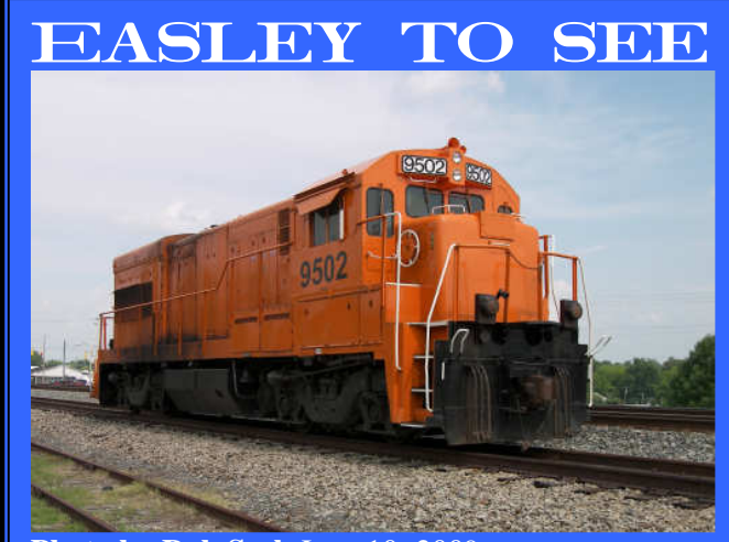
June 10, 2009 Pickens Railway U-18B No. 9502 (ex-CXS 1918, nee-SCL No. 320, built 1973) awaits transfer to Pickens for an overhaul. This unit actually had spent much of its time leased out to Johnson Rail Service in Laurinburg and Monroe, NC, but has also been photographed in this month in an NS consist through Boyce, VA. The Pickens has eight U-18s on their roster.

This is the direction your association officers would like to pursue. We are open to and welcome any questions or comments.