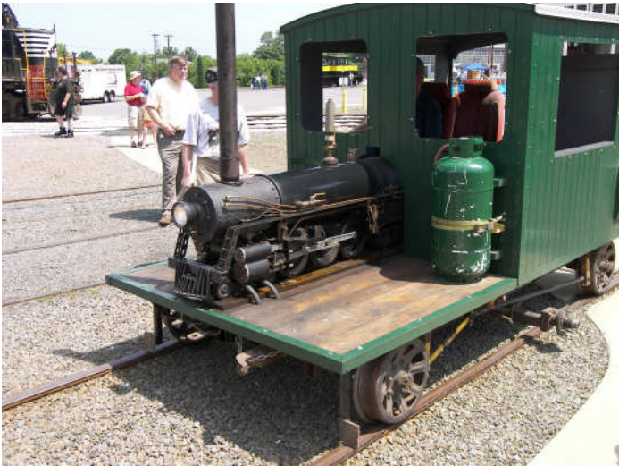
Top left: Seaboard Air Line 2-10-0 Russian No. 544, built by ALCO in 1918. Upper right: NS GP-59 4610. Lower left: NS SD70M-2 No. 2720 reflected in the windows of the Back Shop, which is still closed awaiting renovation. Lower right: A Steamer Speeder! Among the half dozen motor cars that provided short rides was this propane-fired steamer. The "live steam" locomotive has belts looping the driver axels that propel the car. It was also the quietest one of the bunch.