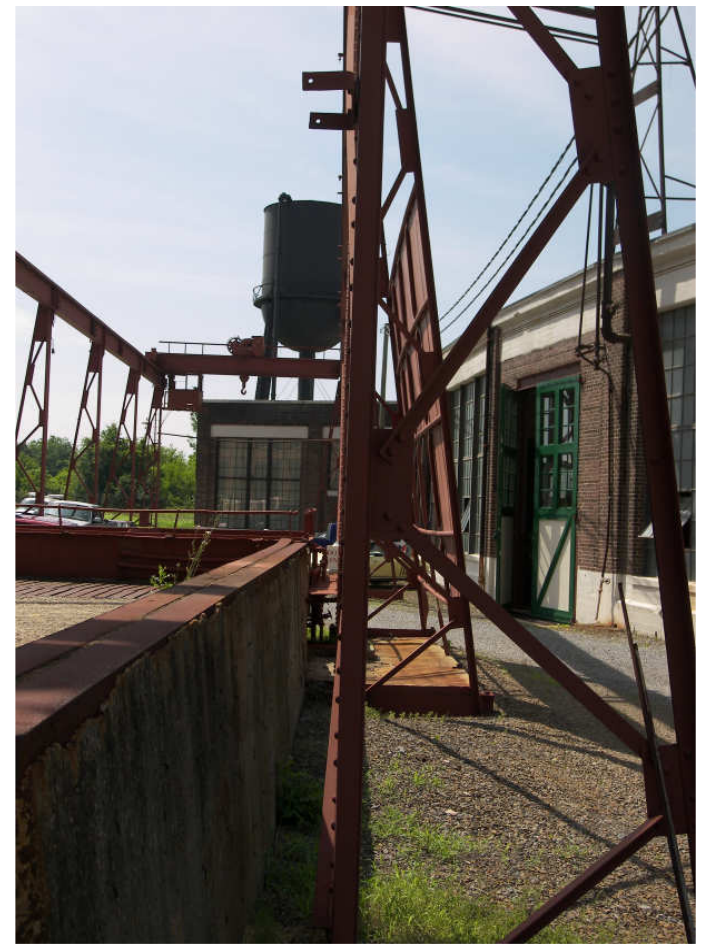
The 1924 Flue Shop and bridge crane by the roundhouse provide many architectural / industrial photo opportunities (above left and lower right). Ex-Southern, Pullman Standard 10-6 Sleeper No. 2003, named "Catawba River," (built 1949?) resides in the roundhouse (lower left), as does ex-Duke Power saddletank 0-4-0 No. 111, built by ALCO in 1922 (above right).