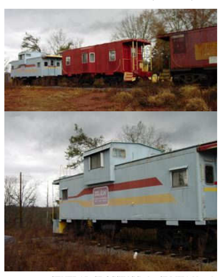
CENTRAL CROSSINGS, the CRMHA Newsletter