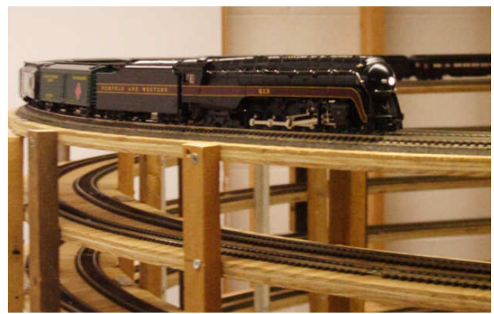
A new, unassisted J-class model leads the Birmingham Special up one of four helixes on Bob's layout at the Christmas party.