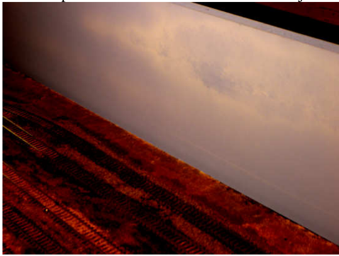
New clouds above the freight yard are painted with Rob's air brush and paper towel technique.

Meanwhile, yours truly was learning a new trick. Doc offered up a job of painting clouds onto the freshly painted, all-new backboards and even provided an inexpensive airbrush for the task. I had painted clouds before with brushes, sponges, or spray cans, but this was my first attempt at airbrushing. Judging by the on-the-spot reviews, I believe I passed the audition for the rest of the job.