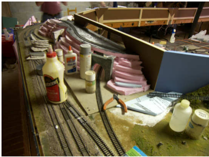
The new logging spur snakes through the woods above the wye that leads to the new interior staging yard.