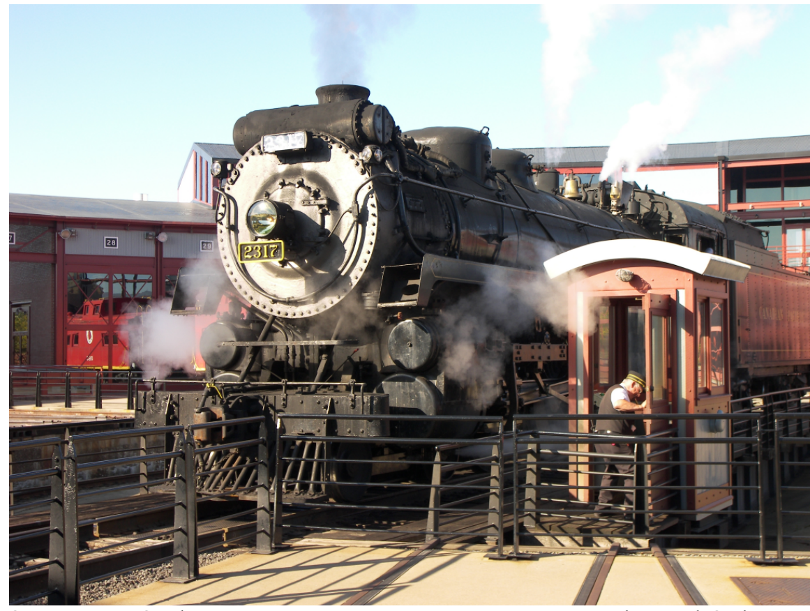
Scranton, PA, October 10, 2008

CRM&HA 2009 Train Show Easley, SC Feb 28 - Mar 1