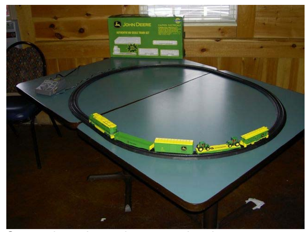
See we brought two layouts to the show