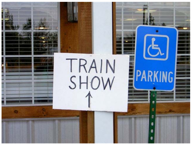
Low Tech Sign