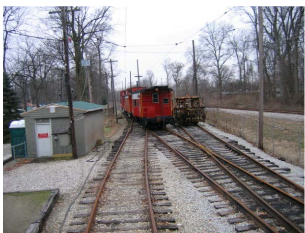
#1 - NKP cabooses and ballast machine.