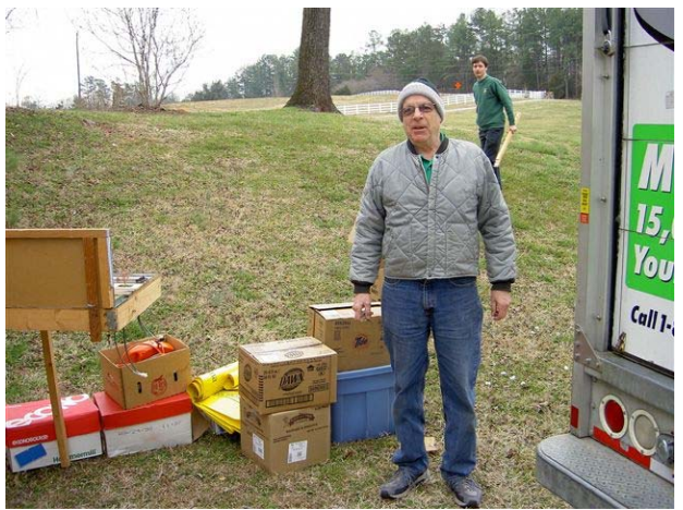
Its cold and I have to go before the rental place closes