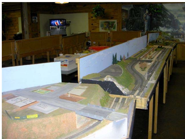
If we only had the truck by the door