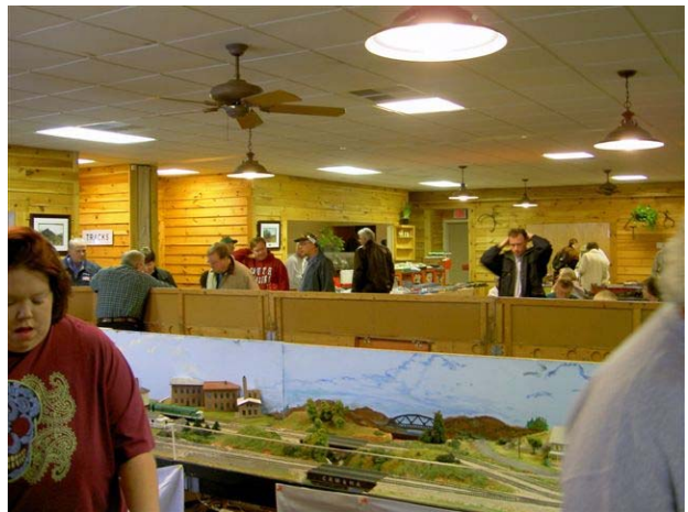
Over 150 people saw the layout