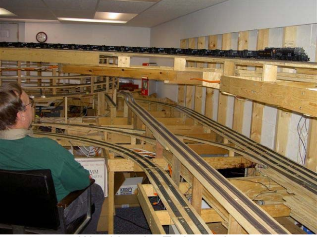
Watching the Trains go by