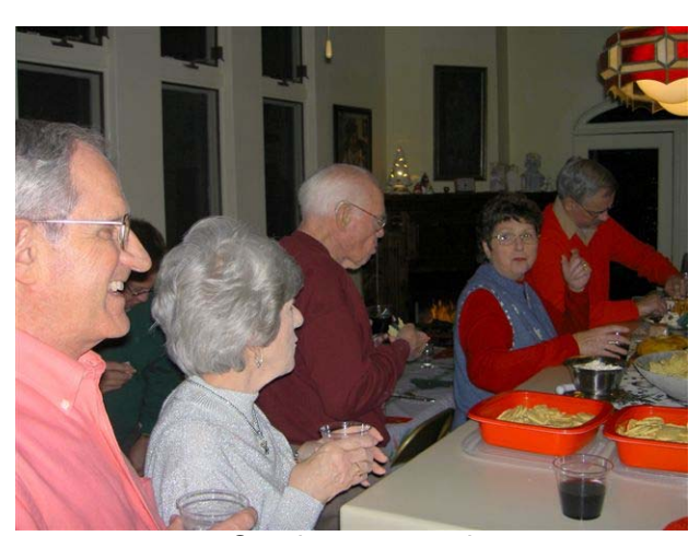
Snacks are served