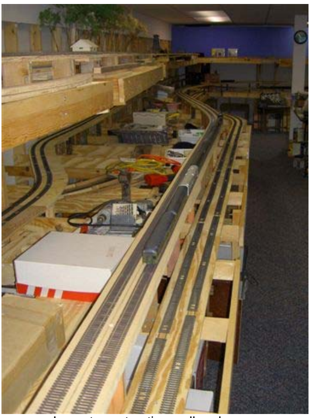
Layout construction well underway The Trains Run