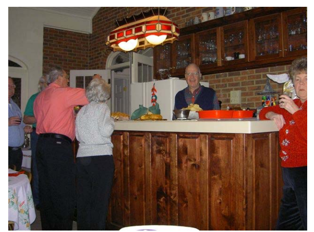
The Bar is Open