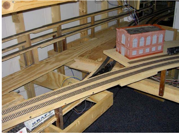
A few buildings are showing up on the layout