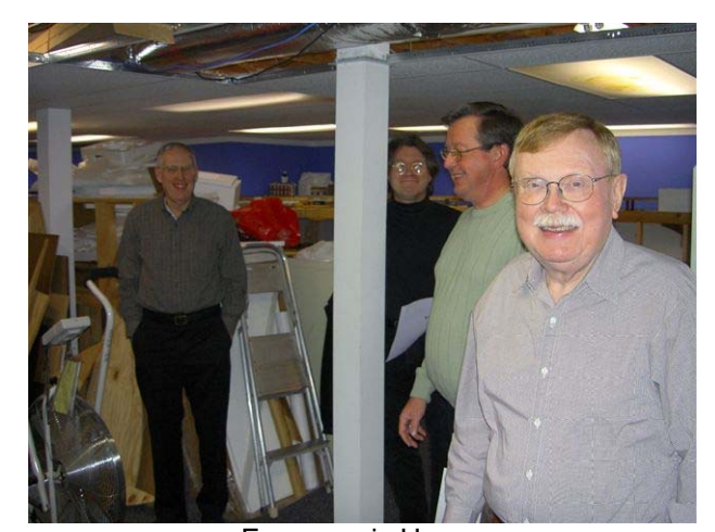
Everyone is Happy