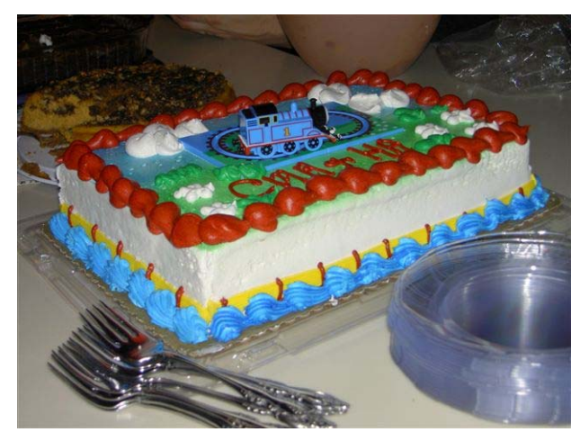
A Real Operating Train Layout On a Cake