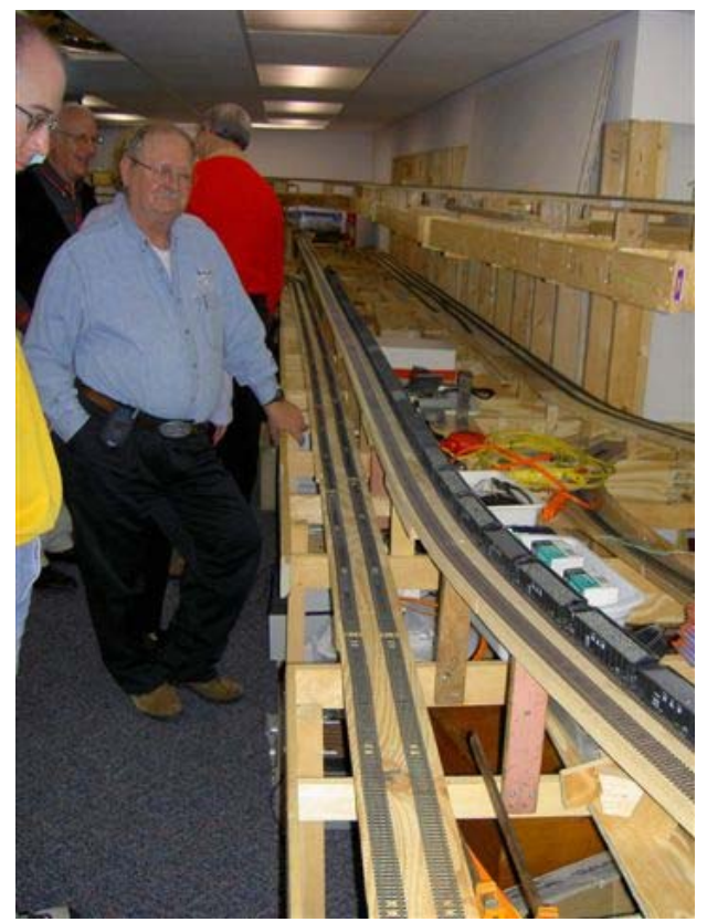
A Long Coal Train