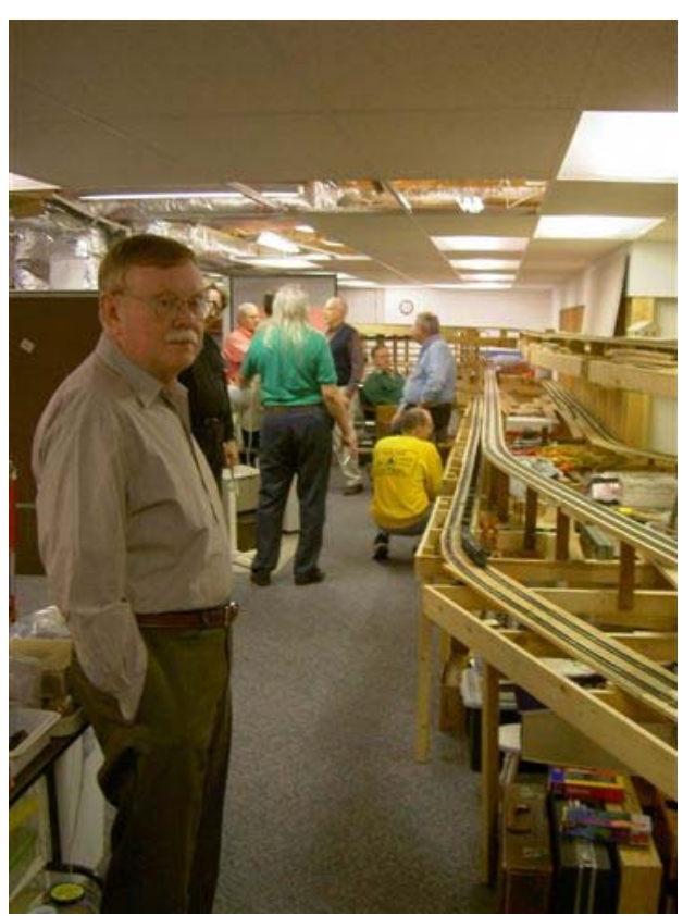
Mac checks it out