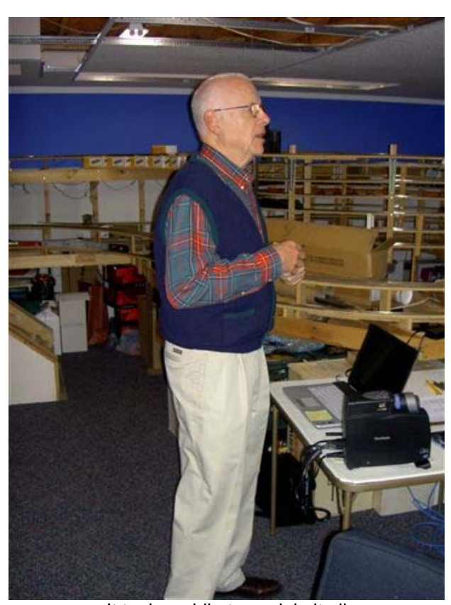
It took a while to explain it all