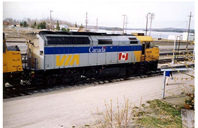
Where are you, Jeanne?