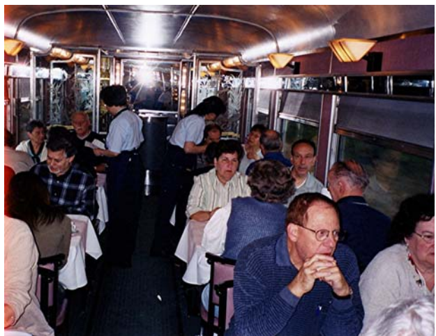
Dining Car Service is Great!