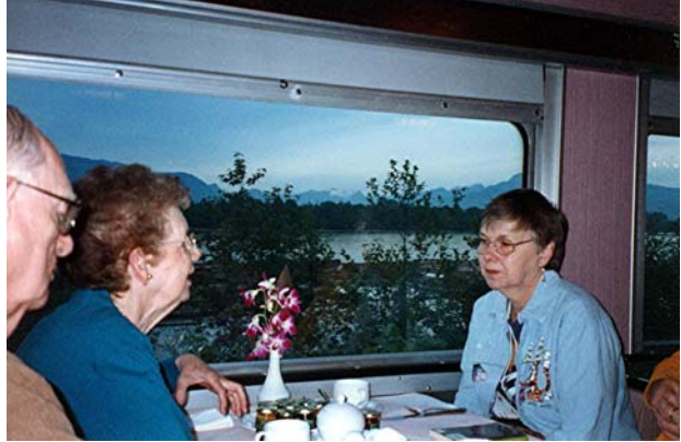
Look at the Scenery!