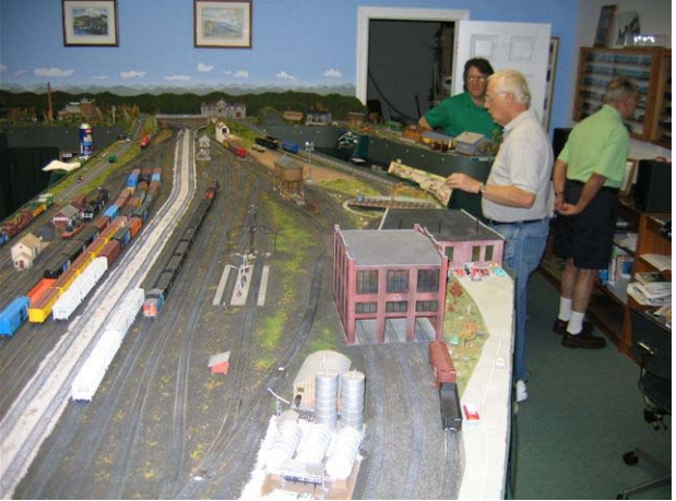
Another Apple Valley

September: The Picnic will be September 11<sup>th</sup>. October: Dale Reynolds November: Volunteer Needed December: Christmas Party at Folsom's