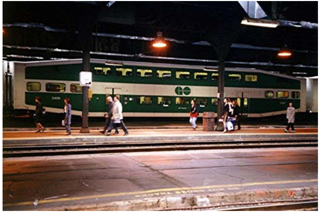
Commuter Train to Toronto