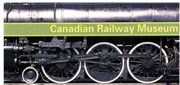
The Museum is at Delson, Quebec near Montreal.

It was a let-down from VIA, but it was a clean and roomy coach, with comfortable seats, so we could watch the beautiful coastal scenery all the way to Portland. Returning to reality, after an all-inclusive Elder Hostel Excursion, we went to the lunch car, where we purchased our soup and sandwich lunch, in something less than dining car luxury!