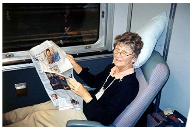
Compartments are Nice!