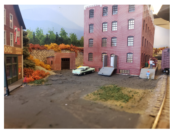
April 2019 - Page | 4